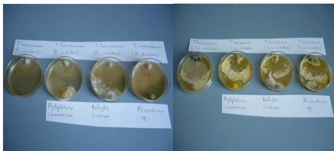
Plate 5: Competition assay between T.harzianum P1 isolate and pathogenic fungus Plate 6: Competition assay between T. harzianum T22 ATCC isolate and pathogenic fungus

Table 1 shows the time interval at which Trichoderma harzianum (T22 isolate) grew over pathogenic fungi - R. solani , Botrytis cinarea and P. cinnanerium . It was evident that within 72 hours (3 days), Trichoderma harzianum (T22 isolate) hindered the growth of R. solani , Botrytis cinarea and P. cinnanerium . Similar trend was observed when Trichoderma harzianum (P1 isolate) competed with R. solani , Botrytis cinarea and P. cinnanerium (Table 2).