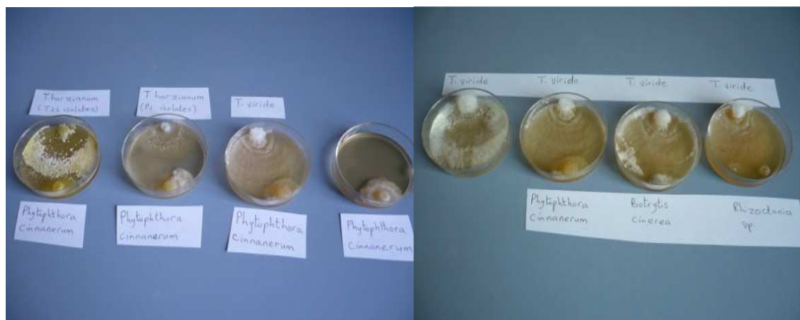
Plate 3: Competition assay between Trichoderma and pathogenic fungi ( P. cinnanerium )

Plate 3 shows the bio-assay competition between Trichoderma harzianum (T 22 and P1 isolates), T. viride and P. cinnanerium in the laboratory. It was evident that Trichoderma species grew faster, overlay P. cinnanerium and prevented its further growth and development. Trichoderma species proved to be aggressive competitor over P. cinnanerium . Plate 4 shows the competitive bio-assay between Trichoderma viride and pathogenic fungi ( R. solani , Botrytis cinarea and P. cinnanerium ). It was evident that T. viride grew faster to inhibit further growth of the pathogenic fungi ( R. solani , Botrytis cinarea and P. cinnanerium )