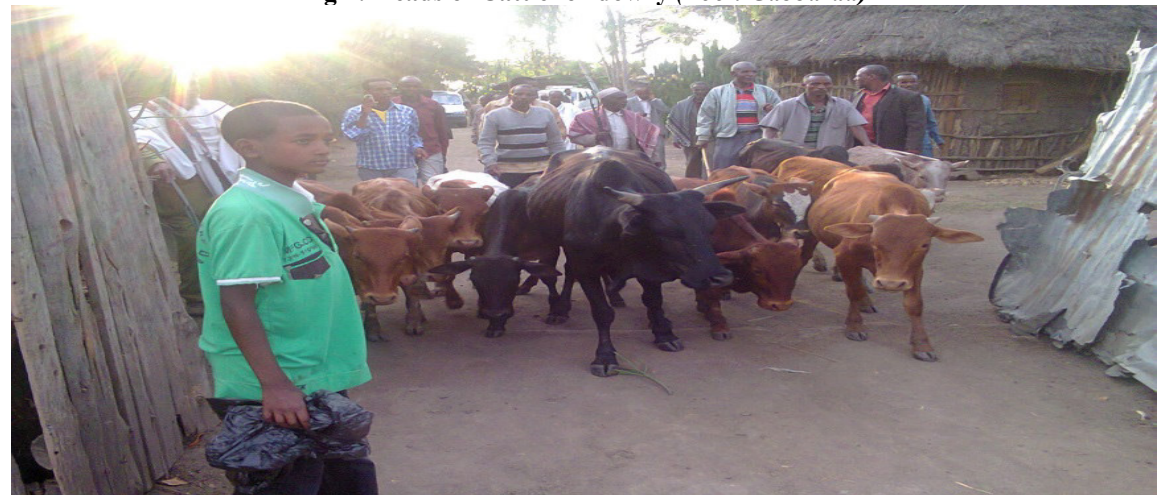
Source: From Researchers' observation of Gabbaraa marriage ceremony, May, 2017.

As can be understood from the above photo, these numbers of cattle are given for bride's family in a time only on a single Gabbara marriage ceremony. This reality is similar with the data gained though questionnaire and interview from respondents. Even though the number of cattle may not equal, some cattle are gifted as geegawoo (cattle gift by bride's family) and vice versa.