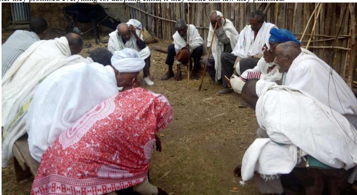
Figure 4: Blessing during Guddifacha ceremony (photo taken during field observation, April 2019).

After they promised everything for adopting child, if they broke this law they punished.