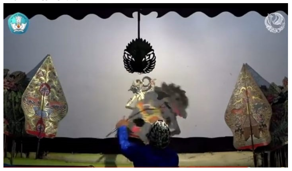
Figure 1 Work Performance Documentation

Gathutkacha's stance was launched to Dhadhungawuk. His movements are energetic, very agile, and always on target. His speed was lightning fast, so Dhadhungawuk didn't get a chance to retaliate. Dhadhungawuk was beaten by Gathutkacha until he fell up and down. Dhadhungawuk was overwhelmed by Gathutkaca because his bite did not injure Gathutkaca at all. His attacks did not hit at all, instead, Gathutkaca attacked him over and over. The Samberan war motion was displayed as the composition has been made. Dhadhungawuk's defeat was marked by the success of Gathutkaca rising on Dhadhungawuk's shoulders and holding the giant head of the buffalo herder. The war scene ends with kayon's exploratory motion. The performance was really completed with the kayon mark stuck in the middle of the top gedebog screen. The accompaniment of Sampak Laras Slendro Pathet Sanga has stopped playing.