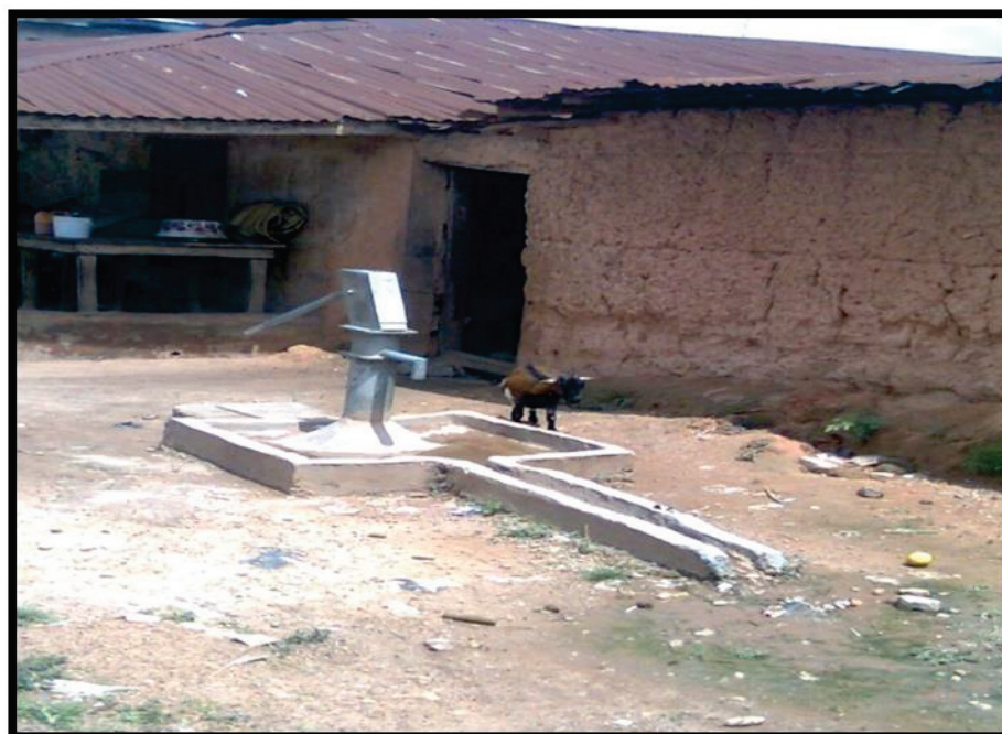
Plate 2: Non-functioning public borehole with hand pump devise in the study area