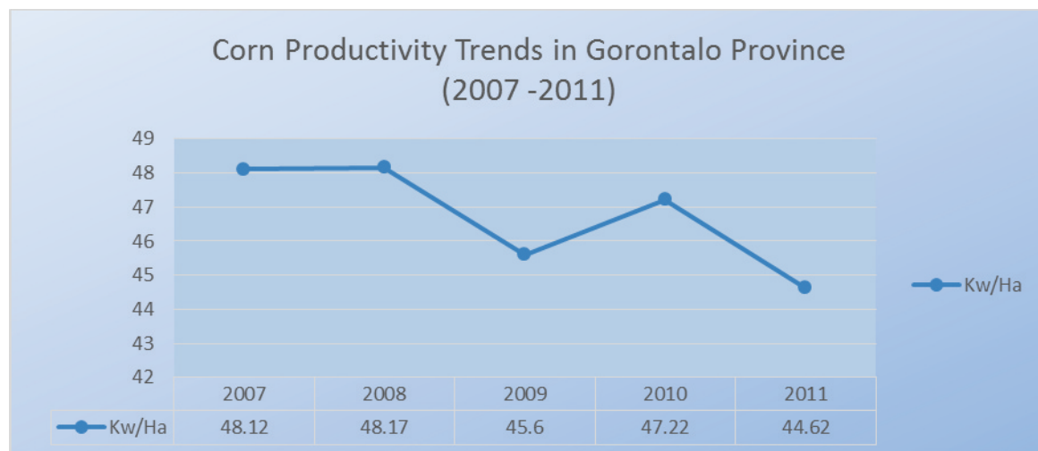
Diagram 2. Corn Productivity Trends in Gorontalo Province (2007 -2011)