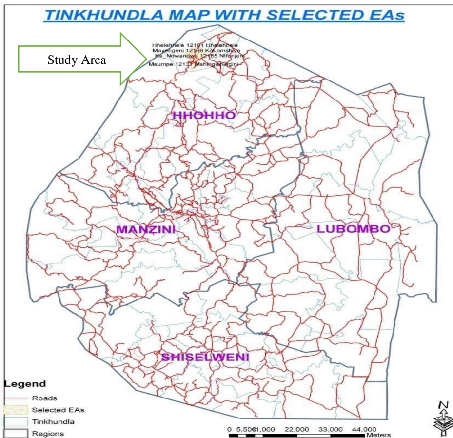
Figure 2. Study area map: Source: Central Statistics Office