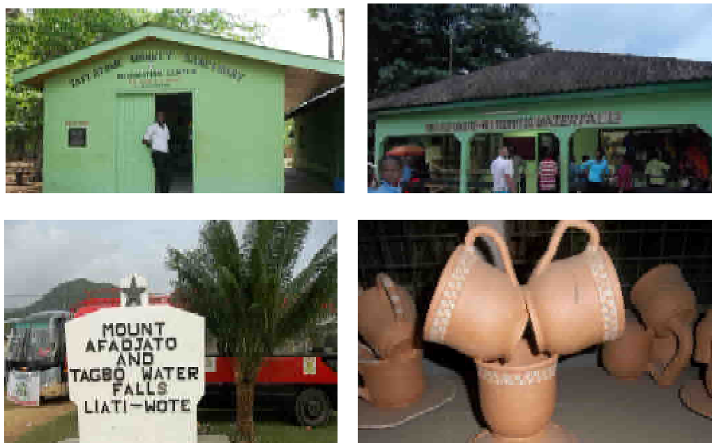
Plate 1: Study Sites and Artifacts on Sale

secondary sources. Data collection instruments involved semi-structured questionnaires and interview guides. Observation techniques were also employed especially on the utilization of the tourism revenue. A sample size of 150 households was considered for the three case communities. Purposive sampling was used to select tourist sites, community tourism managers/operators and regulators (agencies), whilst the simple random sampling method was used in the case of the households. In all, qualitative data was collected from a total of 158 respondents, two each drawn from the three communities selected for the study and the rest of the two respondent were selected from the District Tourism Management Unit. The English language was the main medium for the data administration with Ewe to complement since not all the respondents were literate. Data collected from the field was quantitatively and qualitatively analyzed.