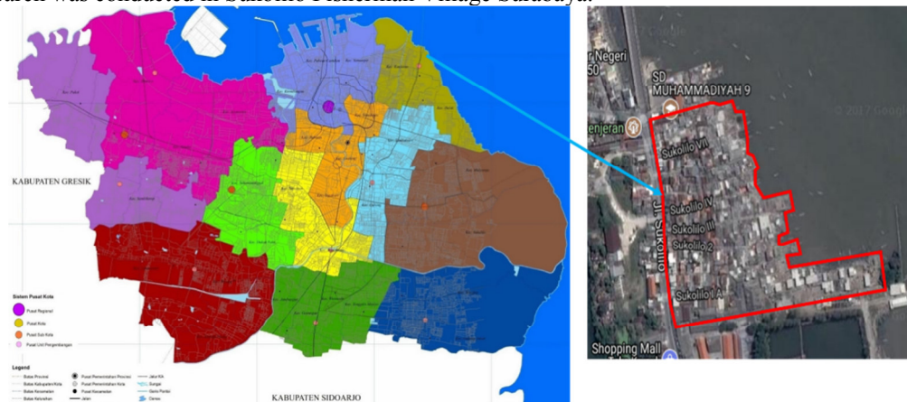
Figure 1. Sukolilo Fisherman Village, Bulak Sub-district, Surabaya

This research was conducted in Sukolilo Fisherman Village Surabaya.