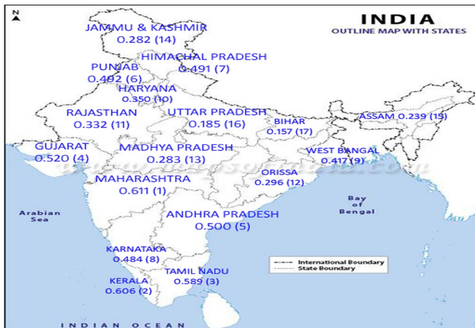
MAP 1 Index Value and Ranking of Indian States according to socio economic development index