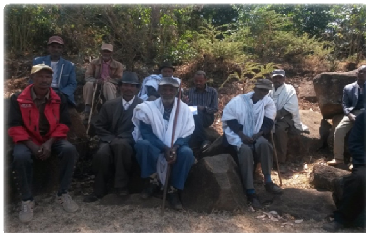
Fig 2: Focus Group Discussion at Kolba Anchabi Pas