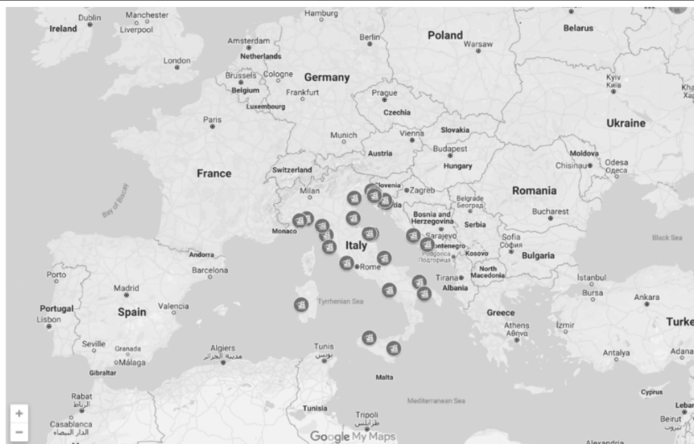
Figure 2 Examined ports location. Created by Google maps tools