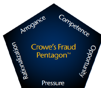
Figure 2.1 Pentagon Fraud

Corruption in RI Law No. 31 of 1999 concerning eradicating criminal acts of corruption states that "every person who is categorized as against the law, commits acts of enriching oneself, benefits oneself or another person or a corporation, abuses his authority or opportunity or means because of positions or positions that can harm the country's finances or the country's economy. " The Pentra Fraud Theory (Crowe's fraud pentagon theory) proposed by Crowe Horwarth (2011) states that competence, opportunity, pressure, rationalization, and arrogance are the causes of someone committing corruption (fraud) as the model in Figure 2.1. Competence or capability is the ability of employees to ignore internal controls, develop concealment strategies, and control social situations for personal gain. While arrogance is an attitude of superiority over the rights held and feels that internal control or company policy does not apply to him, these two dimensions of the causes of corruption that distinguishes from the theory of fraud previously proposed.