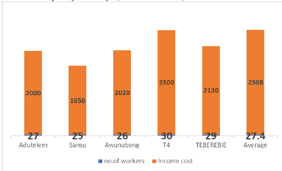
Figure 2. Average employment and cost of a 1-hectare ecological restoration project for forestry.

on average 27 jobs per hectare (both temporal and permanent) and (skilled and unskilled) to the local economy. D. Verardo, and D. Dokken (1998), Ecological restorations projects need community participations and as such believed to employ most of the people from the community in which the project takes place. According to an individual involved in ecological restoration on Adubriem ecological restoration project in AGA, on an average could earn $20.00-$200.00/per hectare depending on the sector of the project they took part in. For an example, a woman by name Gladys said she was involved in grassing and tree planting on Adubriem reclamation project. They were a group of 5 people who grassed and planted trees on a 2-hectare portion of Adubriem reclamation project site and earned $20 per day for 10 days. (field data collection).