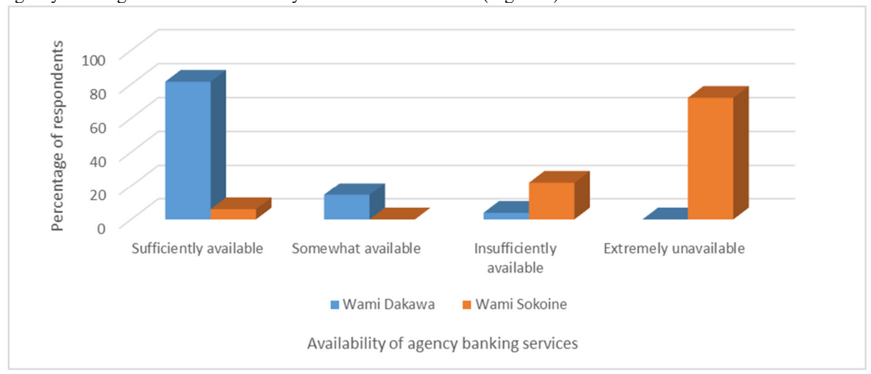
Figure 1: Local community's perception on the availability of agency banking services in the study villages

The study revealed that agency banking services were available in the area with uneven distribution in Mvomero district. The findings show that banking services are sufficiently available in Wami Dakawa as indicated by 81.5% than in Wami Sokoine. The majority of respondents (72%) in Wami Sokoine village declared that the agency banking services are extremely unavailable in the area (Figure 1).