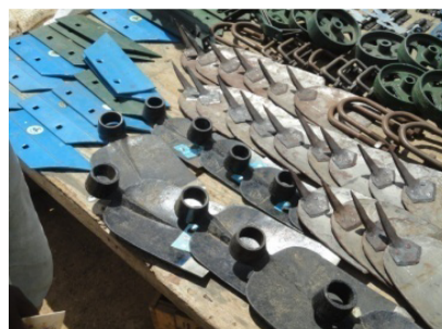
Figure 2: Markets enhance factor input mobility and access