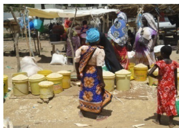
Figure 5: Women in the construction sector Figure 6: Increased women participation in the market