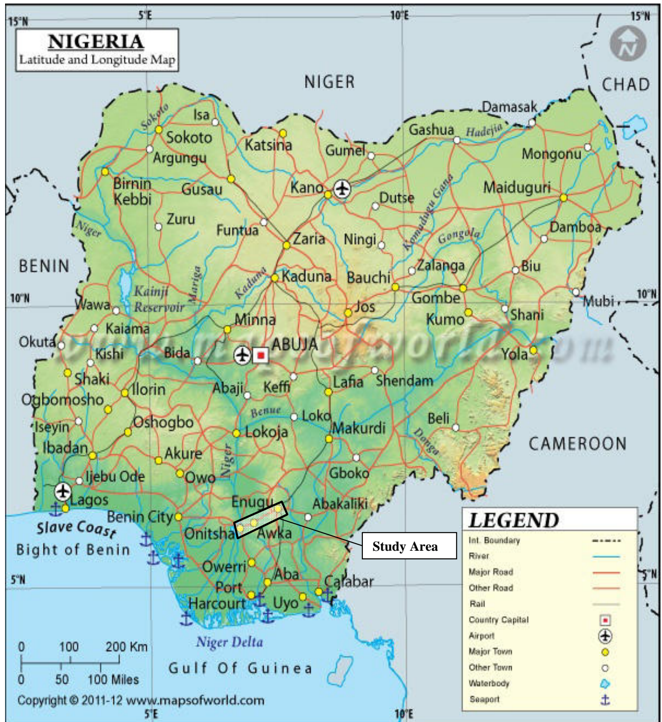
Fig. 1.1: Map of Nigeria Showing the Study Area. (Source: Modified from web extract http://www.ngex.com/nigeria/places/states/enugu.htm ).