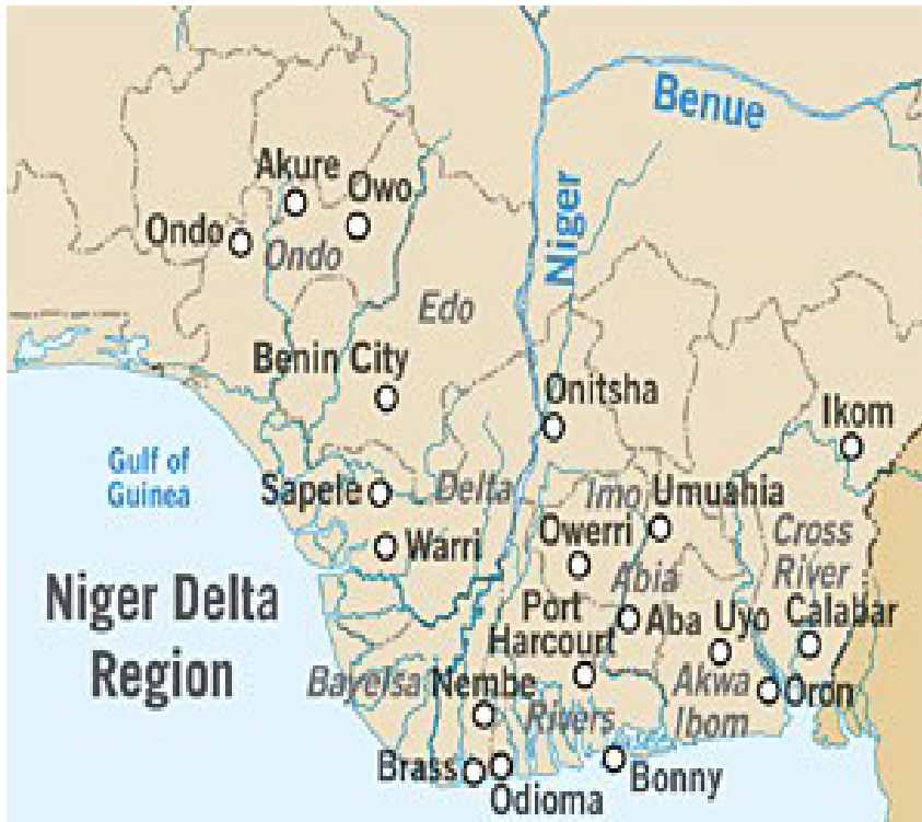
Figure 1: Map of Nigeria showing the Niger Delta Region.