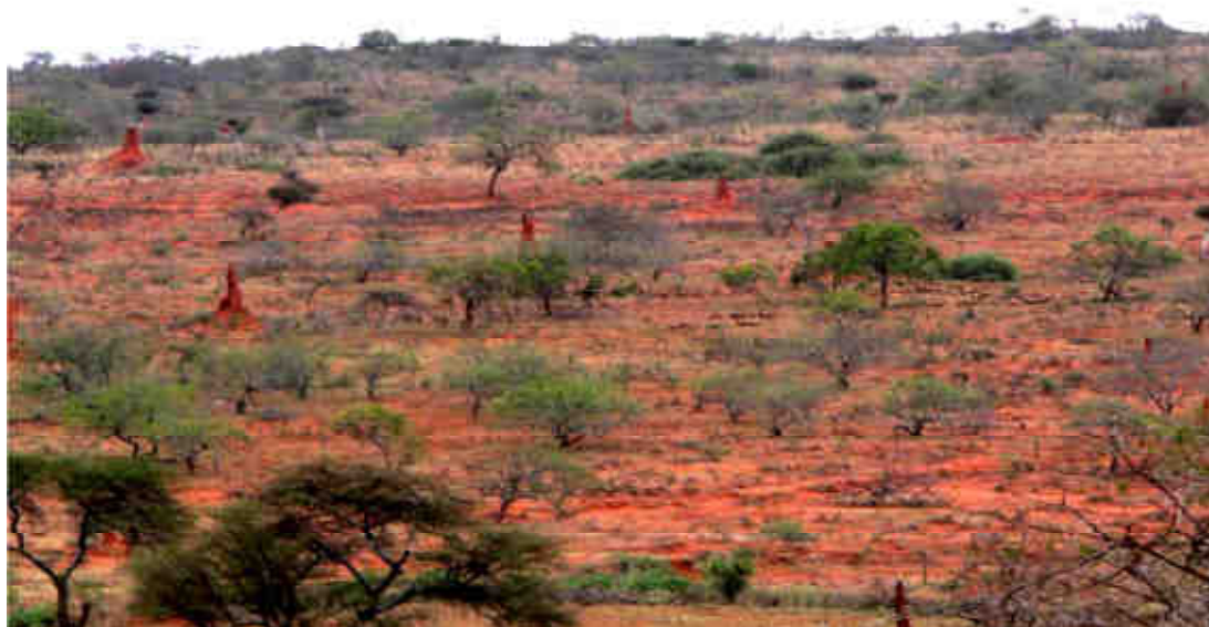
Figure 3 an overview of the extent of land degradation in the Borena rangelands.

Bush encroachment is another feature of range degradation, which is characterized by the invasion of undesirable woody species and unpalatable fobs and loss of grass layer. Bush encroachment is prominent in rangelands where grazing pressure is high. Estimates show that about 50% of the Borana rangeland is covered by unwanted bushes, mainly Commiphora africana (Gufu Oba 1998). It is believed that this species spread rapidly following the ban on the use of fire and due to seed dispersal through camel and goat dung. Traditionally, pastoralists use fire (i.e., rotational burning of the range) as a tool for range management to control undesirable plant species. Burning removes moribund grass, renews the pasture and reduces tree saplings. Following the official banning of fire, the woodlands have thickened, with tree regeneration out-competing the herbaceous layer.