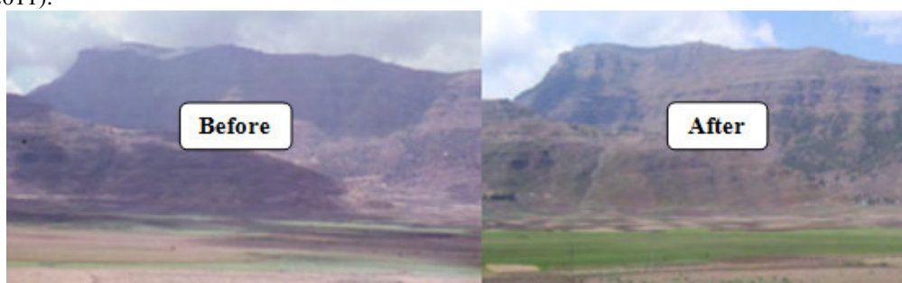
Figure 3: The role of enclosure for rehabilitation (Nyssen et al. , 2007)

Area closure are a type of land management implemented on degraded, generally open access land, are a mechanism for environmental rehabilitation with a clear biophysical impact on large parts of the formerly degraded commons. In closed areas, it is generally believed that the land resources such as soil, wild flora and fauna, or water will be protected from degradation; as a result increasing the agricultural productivity (Aerts et al. , 2004; Descheemaeker et al. , 2006). According the study by Nyssen et al. (2007) the northern slopes of Mountain Tsibet represent the average change with regard to vegetation cover. The church forest at right (Figure 3) is an old remnant forest, but in 2006 other parts of the slopes have been converted into enclosure. The output of proper land management, results the land cover type showed observable improvements and households perceived the gradual and significant changes in soil fertility and improvements in crop yield (Byragi and Aregai, 2011).