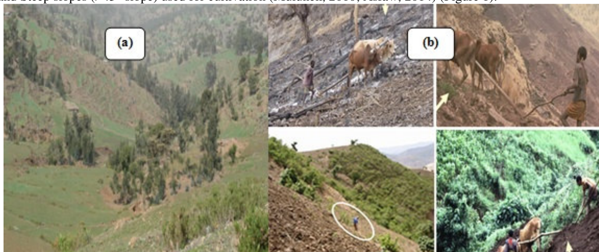
Figure 1: Typical cereal cultivation on steep slope at the headwater of Suluh basin, Northern Ethiopia (a) and Steep slopes ( >45^\circ slope) used for cultivation (b) (Muluneh, 2010; Asfaw, 2014).

and Steep slopes ( >45^\circ slope) used for cultivation (Muluneh, 2010; Asfaw, 2014) (Figure 1).