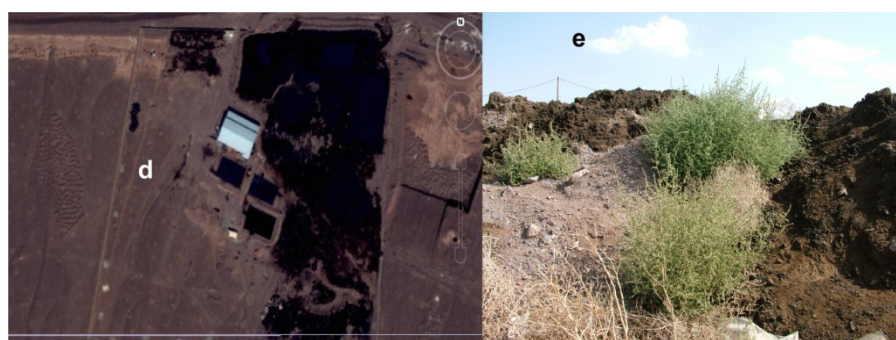
Fig.1 Location of the study area; Map of Iran (a), map of Eshtehard industrial town (b), maps and a picture of acid sludge polluted areas (c) & (d) & (e).