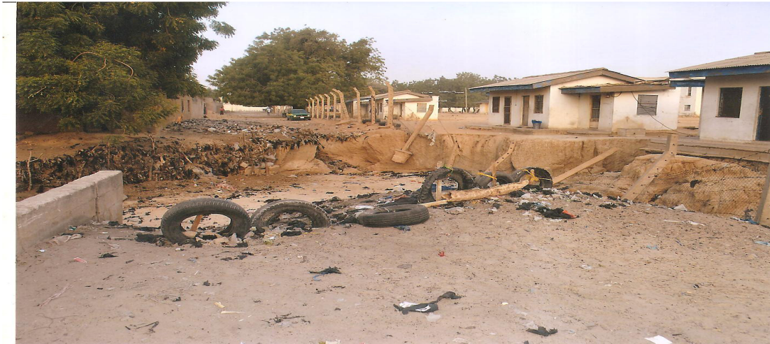
Plate 4.2: Cut off Road by Gully Erosion behind Mobile Police Barrack

The total annual rainfall for Maiduguri from 2003 – 2008 measures between 533 – 897mm. Greater percentage of the stated amount falls between May to September and at the onset of the rainy season, the scanty vegetal cover offer less protection to the soil. Rainstorm induces flash runoff leading to erosion. Cocheme and Fran quip (1967) opined that wherever mean annual rainfall exceeded 500mm, even in the Sahel zone where annual rainfall is low, considerable runoff can occur. When the runoff occurs in an area cleared of vegetation and exposed surfaces, as in most of the locations in the gully sites. Such intense storms can affect near surface mechanical eluviations, leading to the blocking of pores spaces, and reduction in infiltration rate. Hence, the gullies are formed by surface runoff from localized rainfall events of high intensity in the fine to coarse grained particles. The new extension of the gully channel has cuts off the footpath linking mobile police barracks and the police headquarters (plate 4.2).