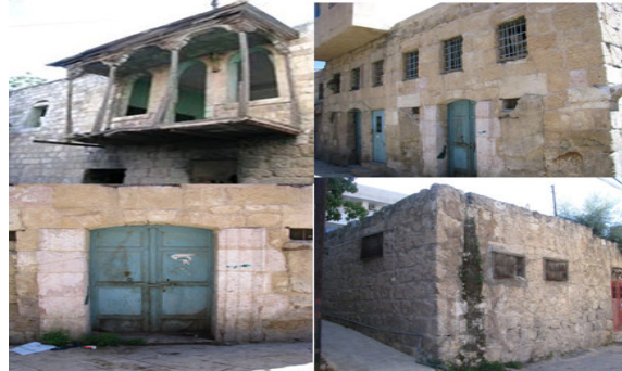
Figure 8. circassian heritage buildings

Many of the Circassian buildings are exposed to distortion and destruction and removal (as we seen in fig.8 ), because they do not fall under the law of conservation of historic buildings and heritage ( Rayyan 1994), which led to a distortion of the general appearance of the city and we didn't benefit from this heritage of the area, where there are more than 20 buildings in the center of city belonging to the period of the arrival of the Circassians, the stage which we cannot be overlooked.