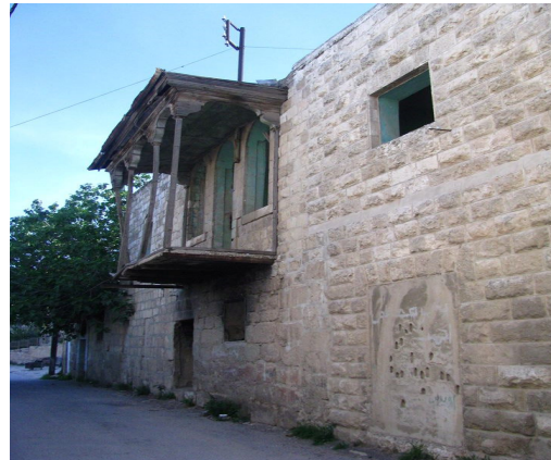
Figure 2. Circassian buildings in Jerash