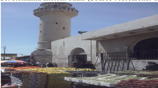
Figure 11. the first mosque in the city of jersh built by Circassian