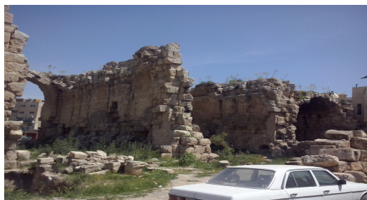
Figure 10. Romania ancient baths