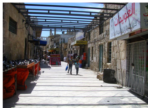
Figure 7. Al atique market at present 2014