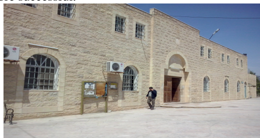
Figure 9. Al Hashemi mosque

The site have many significance heritage buildings, mosques, public plaza, markets and monuments, all these elements make the investment more successful.