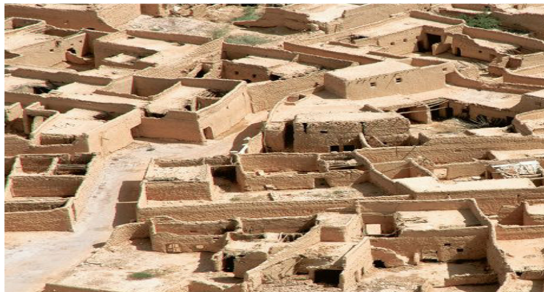
Figure 13. Hai Al Darife