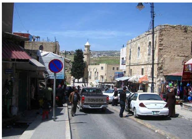
Figure 5. Al Hashemi mosque built near the circassian mosque by local people in 1926.

Local people in jerash affected by Circassian architecture, this influence became clear in the city and played a major role in building the identity of the city (as fig.5).