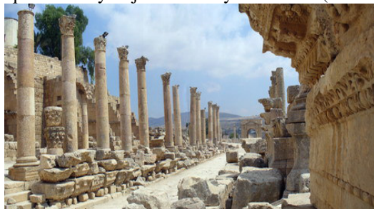
Figure 12. roman monuments (Source : researcher 6/4/2014 )