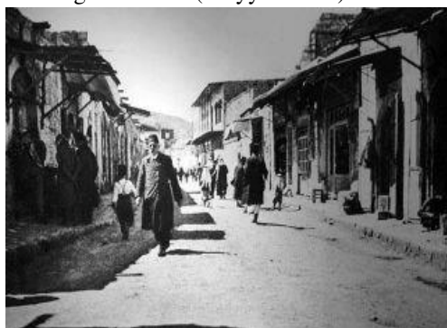
Figure 6. Al atique market in the 20 th

Structural style is different for each building with a common factor s among them are a thickening of the walls, the style of the holes and the materials involved in the construction where it is a stone and mud (An inner layer and an outer layer of stone and clay layer between them) Either the roofing way is different from building to another ( Rayyan 1994).