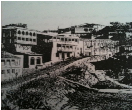
Figure 1. Circassian buildings in Caucasus