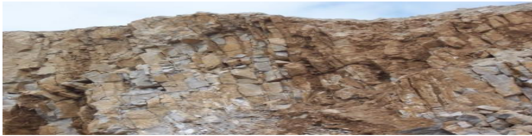
Fig. 1: Limestone formation in a quarry

As limestone, and other raw materials are required to manufacture cement clinker which include clay or shale, sand and iron oxide. However, not all these are required in all cases but their availability needs to be known to determine what qualities of cement can be made from the limestone deposits. In many plants, these materials can be made available from the by-products from other industries, such as fly ash from power stations to replace partly or wholly the clay component or waste materials from the steel industry including slags and oxide rich sludges.