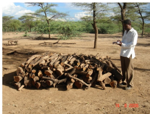
Plate 2: Thickets of Prosopis on shores of Lake Baringo in the background

The goats however, do not digest the seeds due to hard seed cover hence they are passed on in their dung which germinate vigorously under pasture land. Such undigested seeds are also washed downstream by floods towards Lake Baringo and rivers in the study area which enhances their dispersal. In areas where the plant has been cut for charcoal production it coppices heavily with each stool producing on average 5 shoots. This also increases the density of the plant in the study area. The Density of prosopis increases as one approaches Lake Baringo where there are alluvial deposits and plenty of water and decreases towards Marigat Kambi Samaki road where soils are generally coarse and stony.