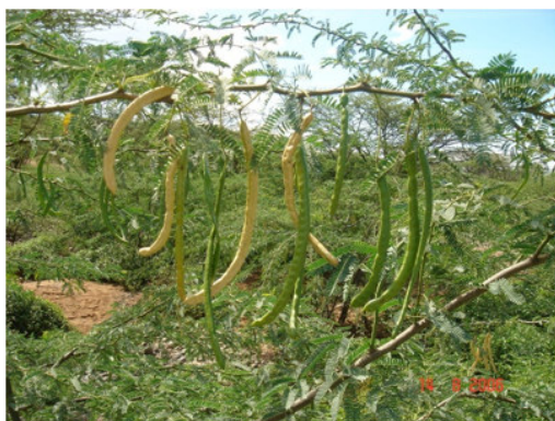
Plate 1: Prosopis pods seed profusely