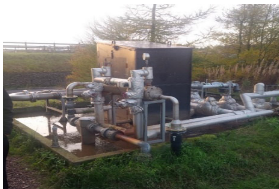
Figure 7: Leachate collection and monitoring system

Landfill Gas management and Leachate Treatment: Currently the site produces 6MWh (Megawatt/hour). It is also connected to the grid with potential to produce 7.2MWh. Meanwhile the leachate system as shown in figure 7 discharges about 100-200m 3 of leachate per day in the leachate reservoir shown in figure 8, from the entire site which has over 10million tonnes of waste. Around about 20-70m 3 comes from the operational cell's large fluctuations due to rain/weather as this is the only open cell, all others have been capped. All is fully treated onsite and discharged at set points and flow rates and so this water naturally returns back into the groundwater system/ ecosystem as a whole so no negative impact on water decrease.