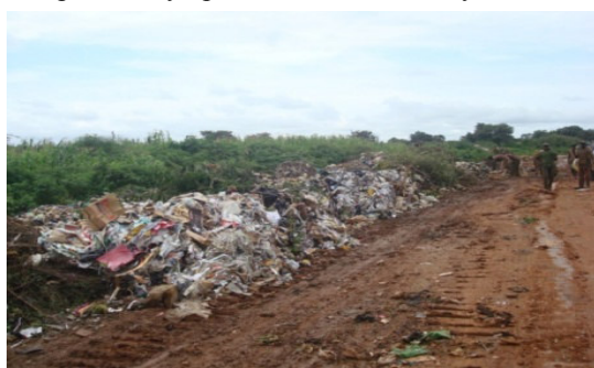
Figure 13: Indiscriminate tipping along landfill road

The Ajata dump site began operations in 1999 and no official closure information was available. The Kubwa dump site only operated for about one year after it opened in July, 2004 before problems with odour and random