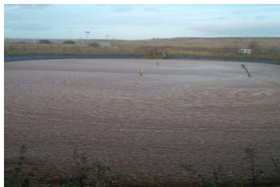
Figure 8: Leachate reservoir