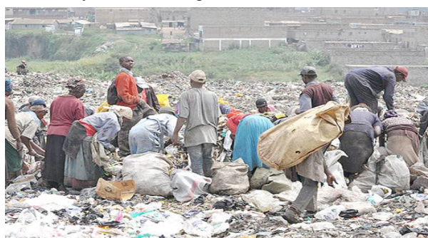
Figure 14: Scavengers collecting recyclable items from tipped waste at Gosa landfill