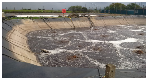
Figure 3: Leachate lagoon being discharged.