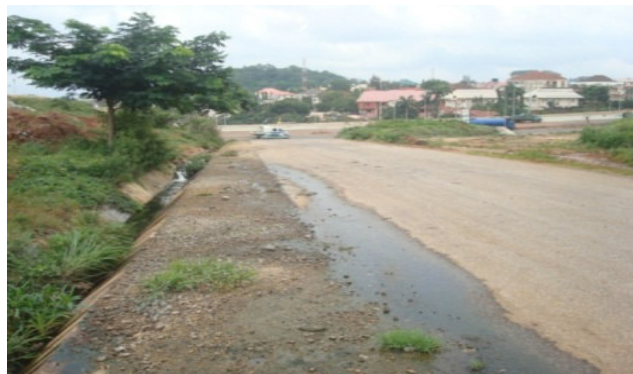
Figure 10: Residential housing near Mpape landfill showing leachate flowing downslope

One of the major issues the AEPB have in managing municipal waste in Mpape landfill is the high volumes of non-degradable aggregates such as polyethylene as shown in Figure 11, which hardly decompose after it has been buried for several years. The cost of recycling polyethylene is higher than the cost of producing new polyethylene which makes it non-profitable to consider recycling (Tunési, 2010). Polyethylene is still quite popular amongst manufacturers in Nigeria because of its low cost and durability, and as such is used majorly for the packaging of high demand products such as drinks, water and other food products (Ahiamadu, 2007).