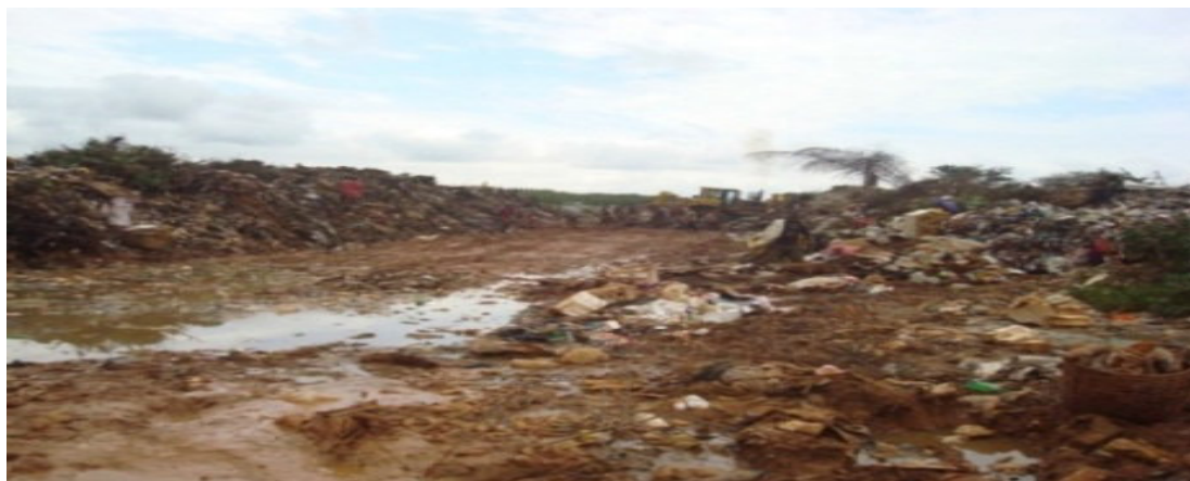
Figure 12: Access road into main landfill dumpsite

A major challenge the AEPB faces regarding management of Gosa landfill is indiscriminate fly-tipping of waste during the raining season due to the inaccessibility of the main tipping point entrance (shown in Figure 13). The indiscriminate tipping increases management costs for AEPB as they have to clear the waste properly and place it at the designated tipping point to ensure the landfill remains operational. Currently engineered waste segregation and recycling is not practiced in FCT Abuja (AEPB 2012). Segregation and recycling is carried out mainly by independent scavengers within the landfill as shown in the figure 14. The scavengers sort out the waste after it is dumped and sell the collected items in bulk to companies located in different parts of the city and the nation at large. AEPB needs to utilize this avenue as a means of generating revenue toward facilitating waste management operations.