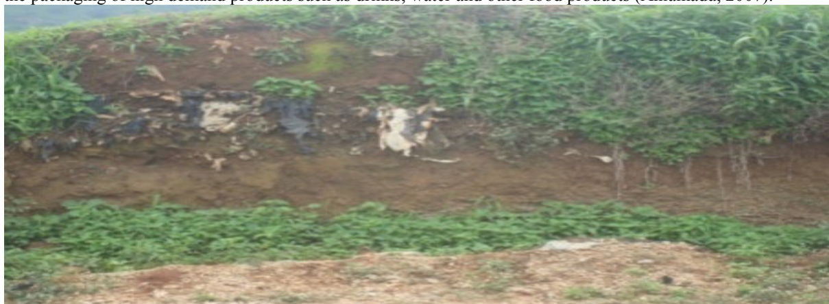
Figure 11: Polyethylene buried years ago in Mpape landfill (Source: Kadafa et al., 2013)

One of the major issues the AEPB have in managing municipal waste in Mpape landfill is the high volumes of non-degradable aggregates such as polyethylene as shown in Figure 11, which hardly decompose after it has been buried for several years. The cost of recycling polyethylene is higher than the cost of producing new polyethylene which makes it non-profitable to consider recycling (Tunési, 2010). Polyethylene is still quite popular amongst manufacturers in Nigeria because of its low cost and durability, and as such is used majorly for the packaging of high demand products such as drinks, water and other food products (Ahiamadu, 2007).