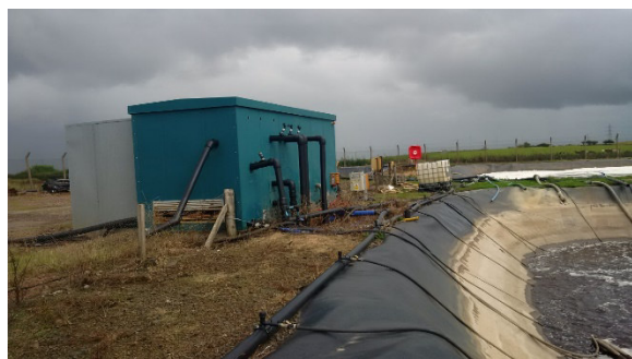
Figure 2: Leachate pumping station

The leachate treatment facility has a 1400m 3 total capacity (two treatment lagoons) lagoon 1 as shown in figure 2 is the leachate pumping lagoon while lagoon two shown in figure 3 is discharged leachate lagoon. It is allowed to discharge 300m 3 daily which cannot be higher than 70 mol/L (ammonia per litre) before it is then treated to a consent level and discharged to sewer. The pools can be lowered to about 40% capacity level before they can be filled back to a level of 95% so as to keep the treatment active