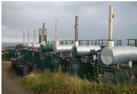
Figure 4: The eight 7.5MW capacity engines installed on site

The Greengairs Landfill is a non-hazardous household, commercial and industrial waste site from the North