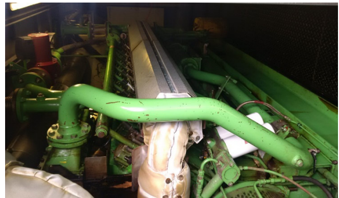
Figure 5: Close view of the V20 piston engine

Lanarkshire area. Greengairs was opened in 1990 and features leachate treatment and landfill gas collection systems which is used to generate electricity for export into the National Grid. The landfill is owned and operated by Foment de Construcciones y Contratas Environment (FCC, 2013).