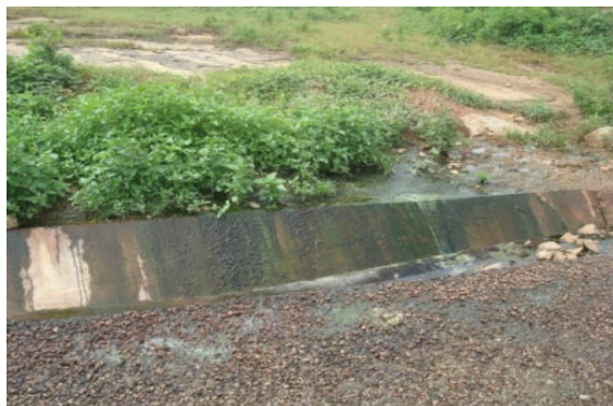
Figure 9: Leachate seeping from the covered ground

residential housing is in close proximity to the landfill with leachate flowing down the slope. During the dry season there are instances of fires from the buried waste causing air pollution and destruction of vegetation within the area.