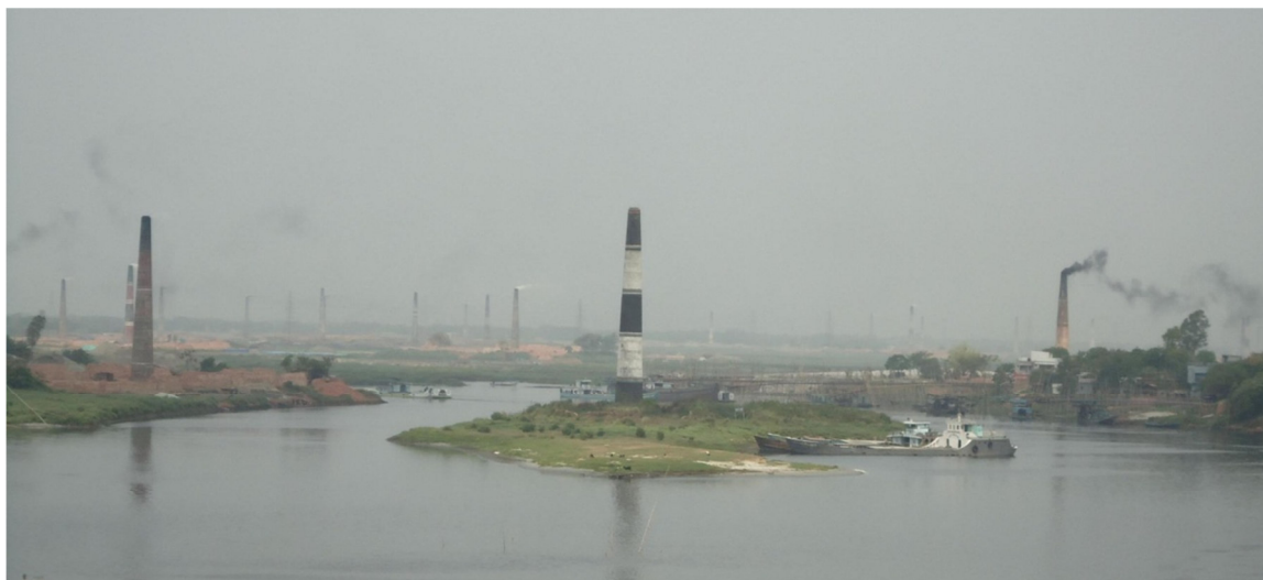
Figure 3: Brick field development encroaching main river channel (encroachment point 1)

According to the land use pattern as is observed in Fig.2, the highest number of land use types, specifically 10 out of 12, has been found in the encroached lands along the south- eastern bank of the river. On the other hand, only 5 types of land use have taken place in the encroached lands along the north-western bank of the river. Therefore, the diversity of land uses found in the encroached lands is more along the south-eastern bank than that along the north-western bank of the river. Yet, the encroached lands along the south-eastern bank is dominated by two land use types, such as housing development and building materials depot and sale center. On the other hand, no single land use has dominantly developed in the encroached lands along the north-western bank of the river.