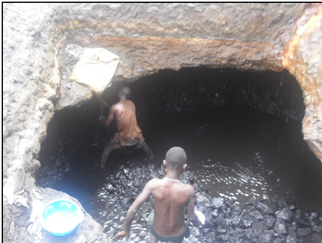
Fig. 3: Coal Mining face at Odagbo

Beneath the Mamu Formation is the Nkporo Shales. The Mamu Formation (Lower coal measures) consists of siltstones, mudstones, grey carbonaceous shales, sandstones and coal seams at several horizons (Ameh, 2013). The shales and mudstones are alternated with thin bands of siltstones. The Ajali Formation is made up of friable coarse grained sandstones and gravelly sands. Overlying the Ajali Formation is the red earthy sand; this was due to the effect of weathering and lateritization (Umeji, 2005).