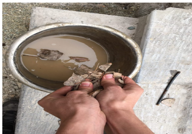
Fig2. The artificial dirty water