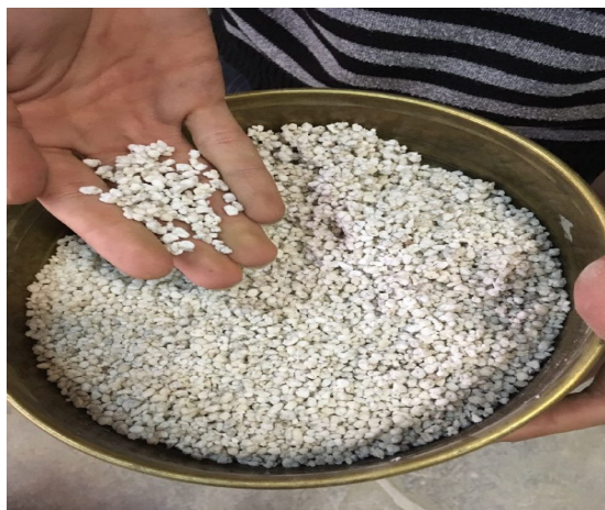
Fig1. The perlite with sodium silicate