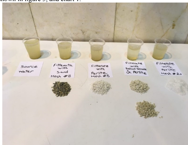
Fig3. The schematic of results derived from each material

The results are shown in figure 3, and chart 1.