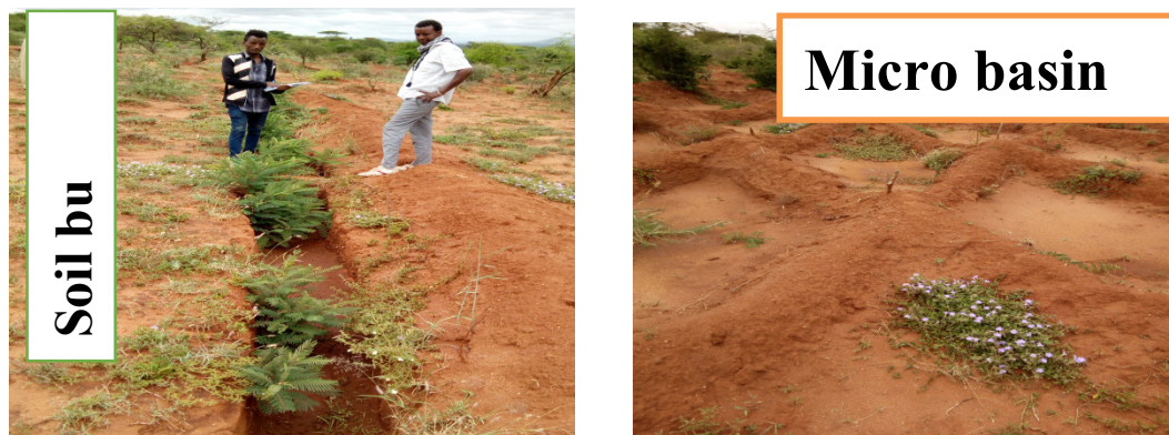
Figure 2. Soil bund and Micro basin in the study area