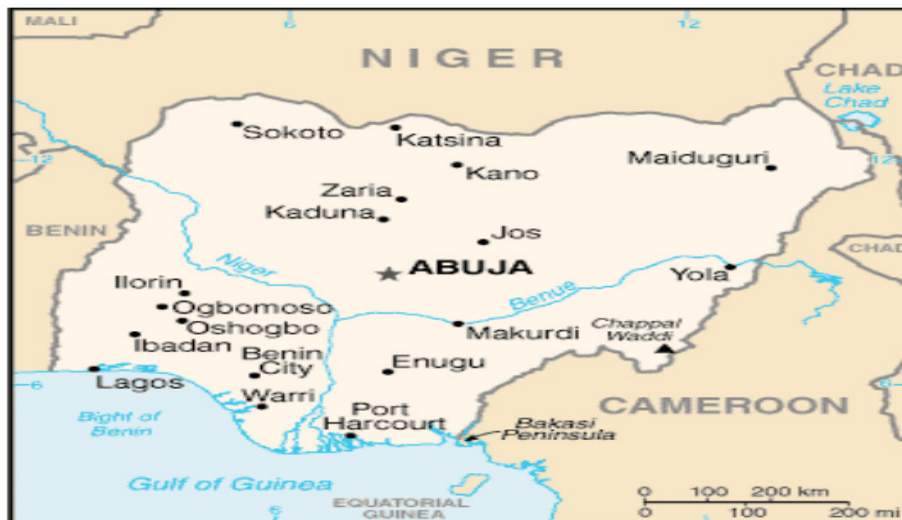
Figure 1: Map of Nigeria showing the major and surrounding river that cut across the Nation