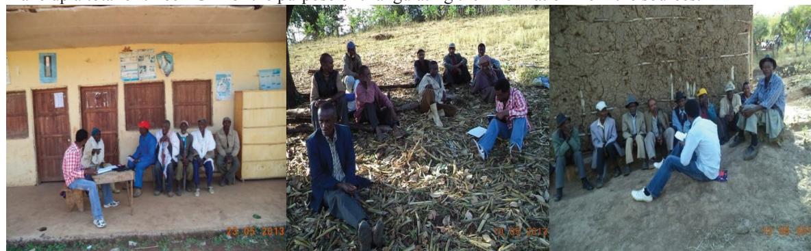
Figure 1: FGD in the highland FGD in the midland FGD in the lowland

For FGD individuals who had long period of experience in farming were selected to discuss specific issues related to climate change and variability. The issues included as to how farmers characterize the weather of their area in terms of temperature and precipitation, what was the local indicators they use to perceive long term change in climate and the major climate related impacts they experienced in the area over the last two decades. Thus, one FGD that consisted six up to eight persons, were held in each kebele (e.g. see the photo below). These make up a total of three FGD for the purpose of triangulating the information from the sources.