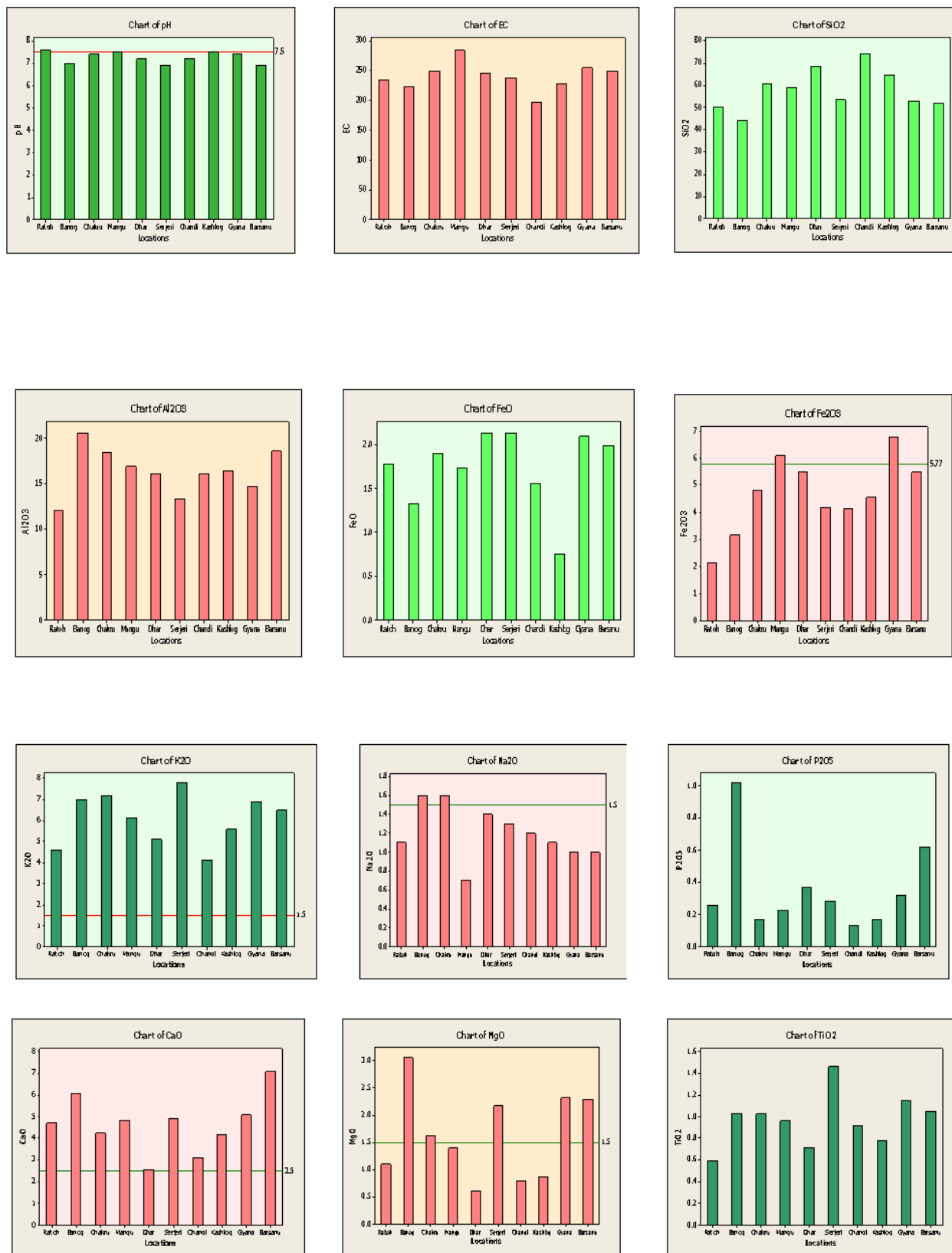
Fig.3 Graphs Showing Physico-Chemical parameters of Soil Samples in the Study Area