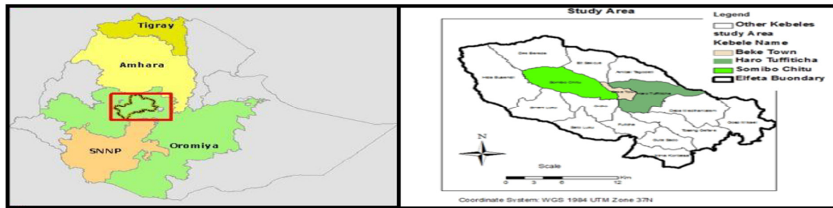
Figure 1: Map of the study Area

Agro-ecologically District is divided into Dega 45%, Woinadega 40% and Kolla 15% agro ecologies. The district has the population of 75,902 out of which 37,649 are male and 38,253 are female (CSA, 2008). The economic activity of the district is mostly agriculture plus very small percent of trade and others. The District has 17 PAs out of which 15 PAs are Rural and the remaining 2 are Urban (Elfeta District Agricultural development office, 2013).