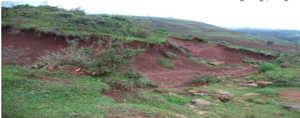
Figure 3: Gullies in Haro Tufticha [Ula Huri Area]

A land that is poorly fertile couldn't give yield as expected and gradually turns to bare land and lacks any form of vegetation cover. As noted during personal observation, many hectares of arable land in the area have been left uncultivated and became un-crossable gullies. The slope of these degraded lands ranges from 25% to 33% creating difficulty for construction of soil conservation structures. Historically, these degraded areas were covered by natural forests before few decades. However, due to increasing need for cultivable land, deforestation had taken place. Moreover, after using land for only 4 or 5 years without appropriate conservation methods, farmers left uncultivated because the land became infertile and inconvenient even for grazing (see figure 3).