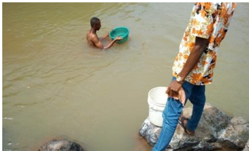
Plate 5: Raw water sample collection from River Orhle Auchi

The mineral river materials will be scooped from the bottom of Orhle River. The sand (fine and coarse) and the gravel materials will be separately washed manually with water repeatedly. The washed sand and gravel materials were disinfected by soaking in a solution of chlorine and concentrated hydrochloric acid for 24 h to unbind the organisms attached to them. The sand and gravel materials were later washed in distilled water, to reduce their pH.