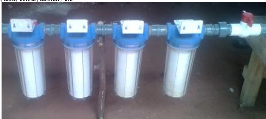
Plate 3: Micro filters

Microfiltration membranes (adsorbent) have pore sizes that vary from 0.5 to 5 microns. This is to separate suspended solids, bacteria, cysts and many other parasites whose diameter are larger than the pore size of the membrane. The adsorbent materials used were activated carbon because of its availability and affordability. According to Agunwamba (2001), adsorption is a process in which molecules leave the solution and are held in a surface by chemical and physical bonding. The absorbed material is called the adsorbate while the absorbing face is the adsorbent. The bonding is physical if it is reversible and chemical if it is irreversible. Adsorbent usually have large surface areas inside the particles (e.g. silica gel and activated carbon). Adsorption removes organics, taste, colour, turbidity etc.