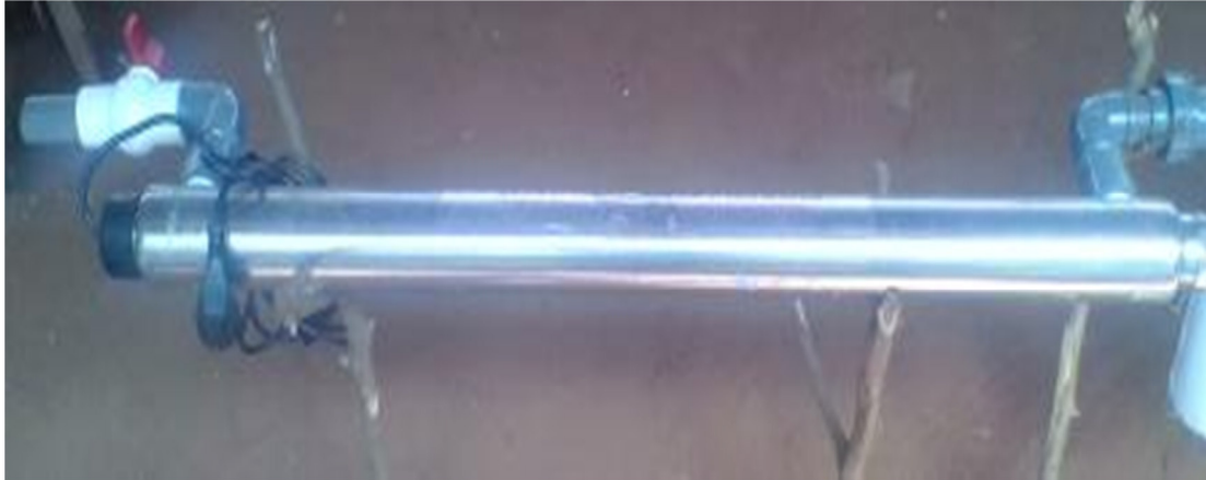
Plate 4: Ultraviolet light

The ultraviolet light chamber is used to generate ultraviolet wavelength with the desired germicidal properties and for delivery of the light to microbial pathogens, which is used for disinfecting the water. When properly connected and powered with electricity, it generates wavelengths of 200 – 300 nm, which inactivates most microorganisms, with the greatest amount of inactivation occurring around 260 nm.