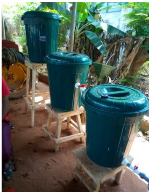
Plate 1: Raw water sedimentation tanks

The sedimentation tank consists of cylindrical plastic container with equal dimensions as that of raw water tank. Here, the raw water is allowed to settle for some minutes. The sedimentation tank was built to allow the upward flow of the settled water.