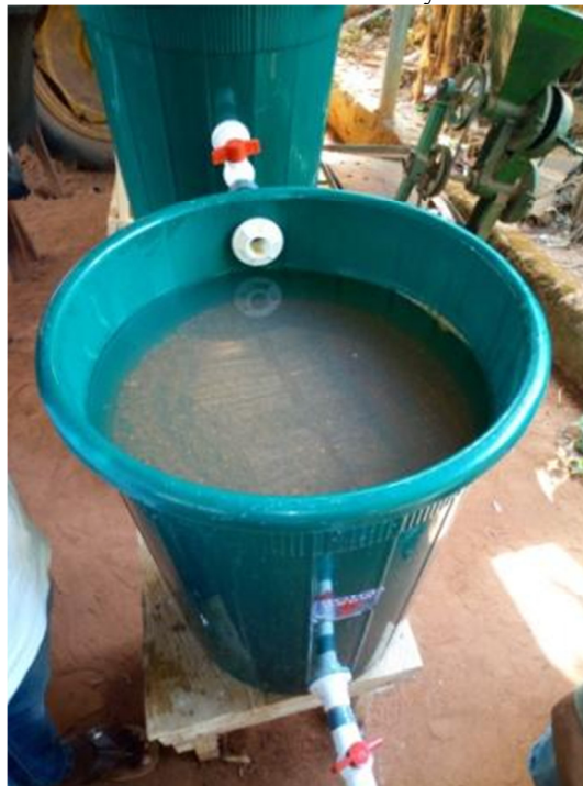
Plate 2: Slow sand filters

This consists of plastic container, filter media (sand and gravel) and under drain pipe. Gravel materials were meant to provide support for the sand bed, and act as filter which prevents sand particles from blocking the under drain system (outlet). It was first introduced into the container to a depth of 15 cm (0.15 m) as recommended by Stevenson (1994) that filters used in water filtration for domestic purposes should range from 0.15 m to 0.30 m in thickness. Then, the fine and coarse aggregates (sand) followed up as the first and middle layers of the media at a depth of 30 cm (0.30 m) and 10 cm (0.10 m) respectively (VanDijk and Oomen, 1978). The sand was light brown in colour and comprises of different grain sizes. It is completely free from clay, loam and organic matter. The material is common and abundant in the locality.