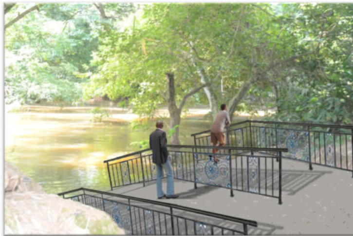
Proposed paradigm for the structural defense and steps into the river