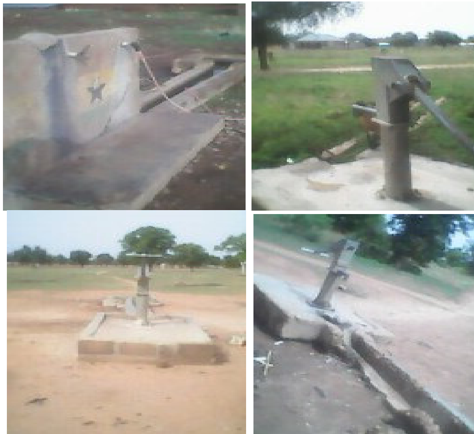
Figure 2. Figure showing poorly maintained water facilities in some of the communities.

Additionally, the study revealed that there was no standard water tariff structure in place in the Kassena-Nankana Municipality. The amount paid varies depending on the type of facility. For instance, those who used boreholes paid 1 Ghana cedi per month, while those who used mechanized systems paid 3 and 10 Ghana cedis, depending on whether one fetched from a public water point or had a house connection. In order to deliver sustained water supply services and benefits over time, an effective mechanism to administer the water supply tariff in terms of cost sharing practices is crucial (Tadesse et al, 2013). The method of revenue collection makes a difference, with payment per bucket superior to a monthly payment, as it is much simpler to manage and more difficult for users to refuse to pay. Sometimes, there are also social pressures acting on the revenue collectors to exclude friends and family from the obligation to pay (Maranz, 2001). The pay-as-you-fetch system was not practiced at all in the communities surveyed even though it was considered to be one of the most reliable and efficient ways of carrying out O&M of the facilities.