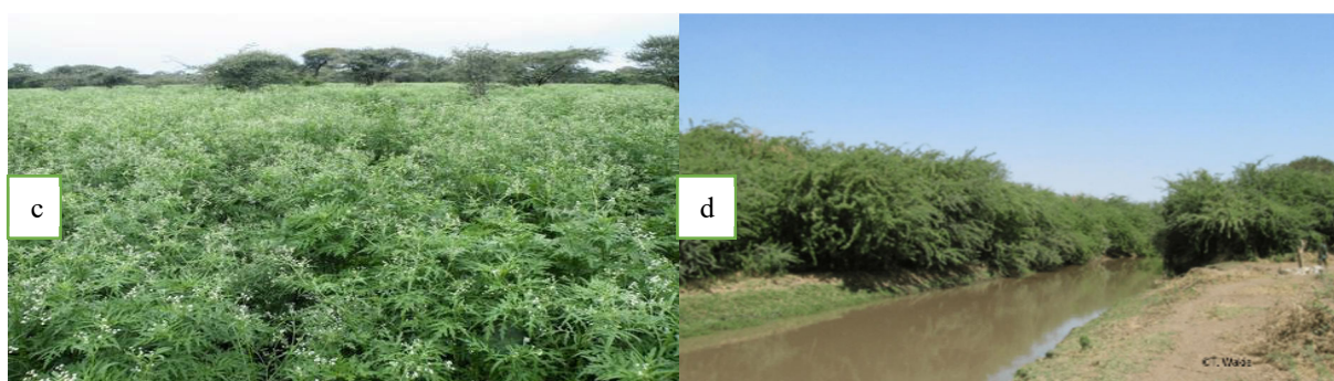
(d) Prosopis Juliflora on wetlands areas of Afar Region, Ethiopia