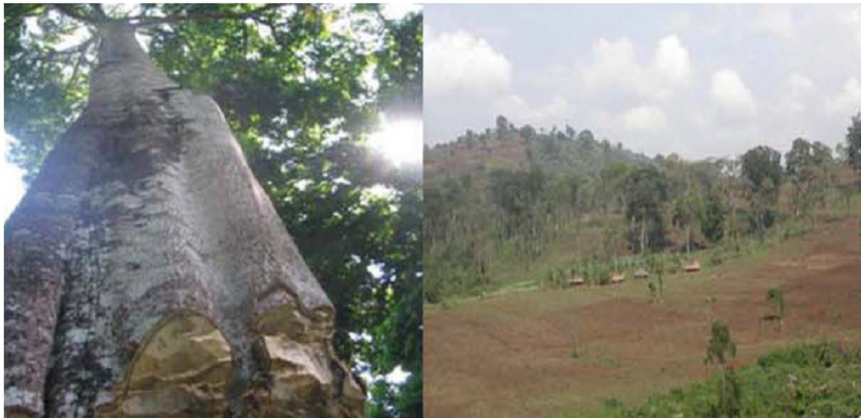
Figure 3: Illegal logging for construction (Left side) and agricultural expansion (Right side) in moist mountain forest of Ethiopia (Gurmessa 2015).