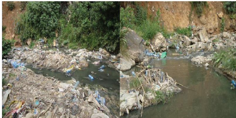
Figure5: Suspended solid wastes on shankila river, Addis Ababa (Maschal and Truye 2018)