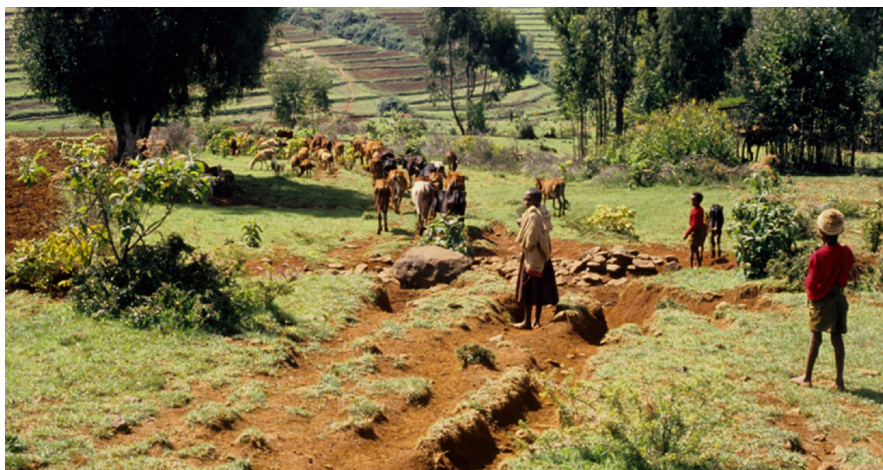
Figure 4: Livestock grazing and foot path accelerating soil erosion in Ethiopia (Mitiku et al. 2006)