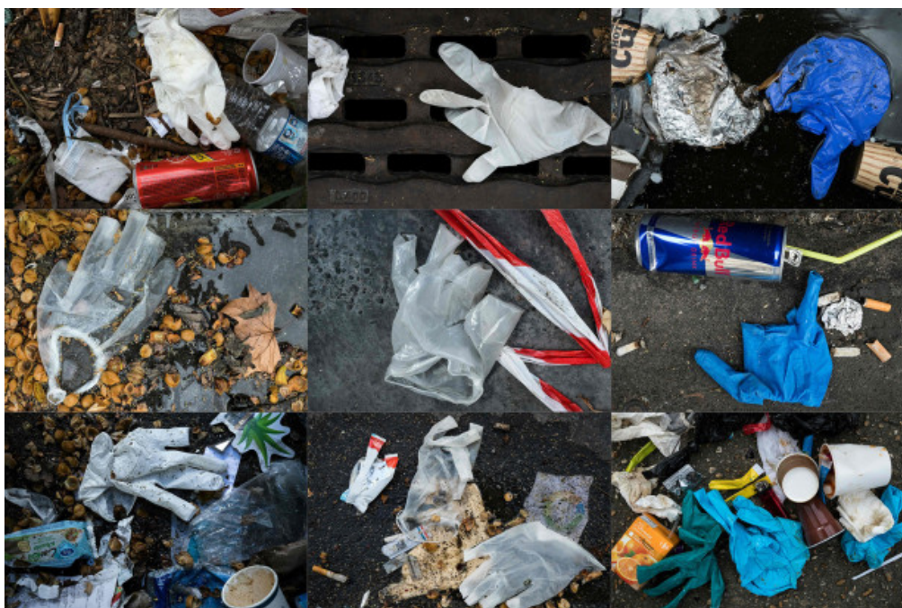
Fig 2 shows part of Kumasi-Adum being littered by hand gloves, face masks due the virus.

As a consequence of the unprecedented use of disposable face masks, a significant number of masks were discarded in the natural environment, adding to the burden of plastic waste in municipal areas of the country. During COVID-19 pandemic, plastics demand for medical usage has increased considerably in all the regions in Ghana. Besides personal protective equipment (PPE) such as masks and gloves, a considerable increase in plastic usage has been related to requirements packaging, and single-use items. Collectively, these shifts in hospitals and regular life may exacerbate environmental issues with plastics, which already existed even before the pandemic occurred. Also tissues and other materials used for sneezing or coughing are thrown haphazardly in to the environment making it unfriendly.