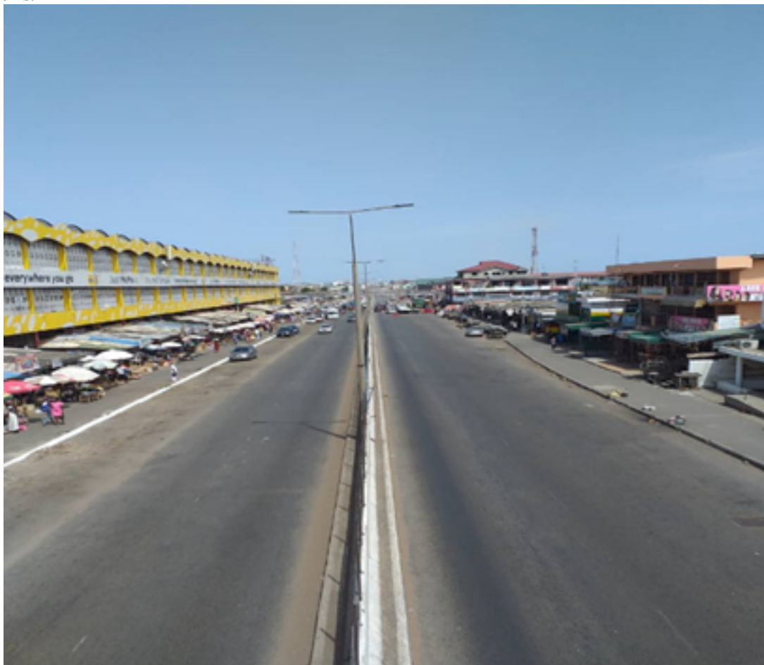
Fig1 The Kaneshie highway showing Kansaeshie market on the left

According to WHO, 2016, 4.3 million people die a year on exposure to household air pollution. Since March, 2020, indoor activities are not affected by the Coronavirus pandemic but rather outdoor activities. Outdoor pollution arises from anthropogenic activities. Anthropogenic sources are related to the production and combustion of different fuels. Human activities are responsible for the increases in ground-level O_3 and GHGs in recent years. About 95 % of NO_x (nitric oxides) from human activity come from the burning of fossil fuels in power plants, engines, homes, and industries. Air emissions are the byproducts of energy production and consumption. Major form of outdoor air pollution includes NO_x , CO_x , Particulate matter ( PM_{2.5} and PM_{10} ), Ozone ( O_3 ), Volatile organic compounds (VOCs) and Sulfur dioxide ( SO_2 ). Main sources of these pollutants are industrial emission and automobile exhaust (Kumar, Nagar et al. 2007, Chen, Brager et al. 2019). The above pollutant contributes significantly to air pollution which has negative impacts on the environment and also causes serious health problems.