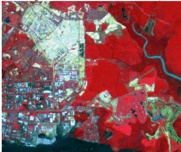
SPOT multispectral image of the test area

Based on the idea that different feature types on the earth's surface have a different spectral reflectance and remittance properties, their recognition is carried out through the classification process. In a broad sense, image classification is defined as the process of categorizing all pixels in an image or raw remotely sensed satellite data to obtain a given set of labels or land cover themes (Lillesand, Keifer 1994). As can see in figure1.