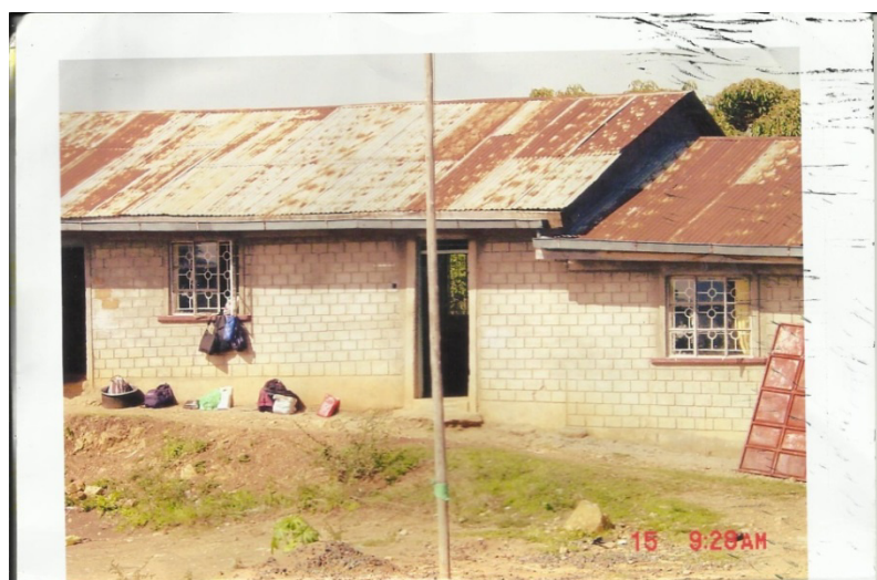
Figure 2: The condition of doors as entrance to classrooms

The rugged entrances hinder students' movements such as the orthopedics. The teacher student ratio is another evident factor that hinders admission of students to schools as admission is done considering the availability of space in the already available classrooms. Students are so many in regular classrooms which hinder the teachers from giving individual attention especially to students with special needs. With problems experienced in admission as principals have to limit admission considering the amount of facilities available in schools. More challenges are met with students with special needs ranging from attendance as evaluated from the attendance register maintained by the class teachers, majority of these students rarely come to school. In relation to the above statement and the analysis of data on teachers also considering the stock of teachers, UNESCO (2005) notes that "stock should be built up into national aggregates by level where applicable such as the stock of teachers in each sector of the educational services compared with the desirable situation based on official staffing formulae"