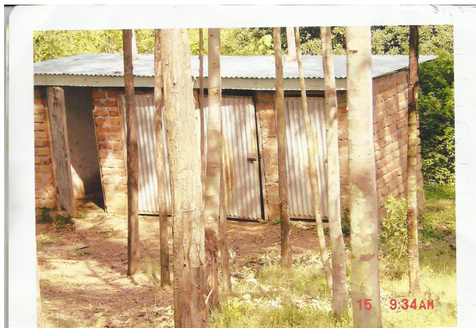
Figure 1: The state of toilet in a participating school