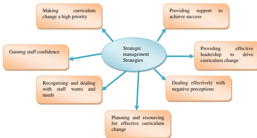
Figure 1: Strategic management strategies (Curee, 2010)

The first category of broad curriculum change strategies comprises the strategic management strategies which include the following: planning and resourcing for effective curriculum change, dealing with negative perceptions, recognising and dealing with staff wants and needs, gaining staff confidence, making curriculum change a high priority, providing effective leadership to drive curriculum change, and providing support to achieve success. These strategies are explained below.