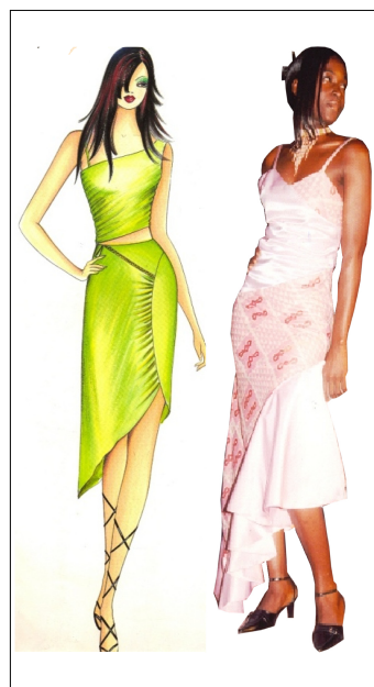
Plate 2: Asymmetric Balance

In a balanced design, the weight of different elements of the design is equally distributed to create balance. This gives stability to the whole design. When the various parts of the design for example colour, texture, line and motif in the fabric have been arranged so that the feeling of equilibrium results, it is a formal design. This is so when the design is the same on either side of the centre (left) as shown in Plate 1 . A feeling of balance is also