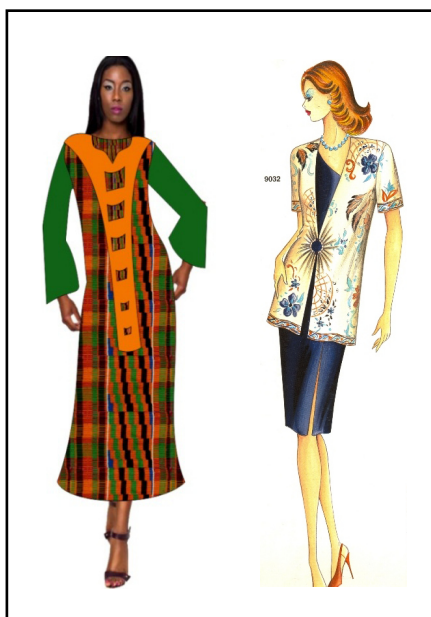
Plate 5: Rhythm by gradation and radiation