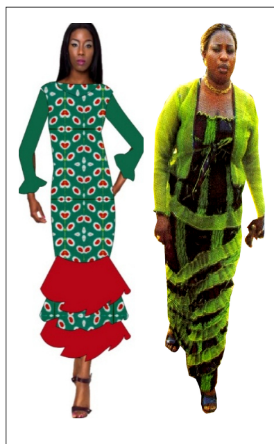
Plate 4: Principle of rhythm

Another principle of design is emphasis. Something that is singled out or made more prominent has emphasis. An element of a design that dominates or becomes the centre of interest has emphasis. A highlight in a design is an emphasis in that design. It is the centre of interest because it predominates over the rest of the design. Emphasis can be created by contrasting texture, colour, lines, dots, or by using an unusual shape sewn onto the garment in the form of appliqué as shown in Plate 3 (left) or fringes (right) respectively.