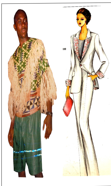
Plate 3: Principles of emphasis

Informal or asymmetrical balance means unequal balance. This means that though each side of the design is equally interesting or important it does not look exactly like the other side of the design it involves placement of objects in a way that will allow objects of varying visual weight to balance one another around a fulcrum point. (Mazumder, 2011) To achieve a more exciting dramatic effect asymmetrical balance can be used. An example is the one shouldered dress and the dress (left) with a slanted hem (right) in Plate 2 .