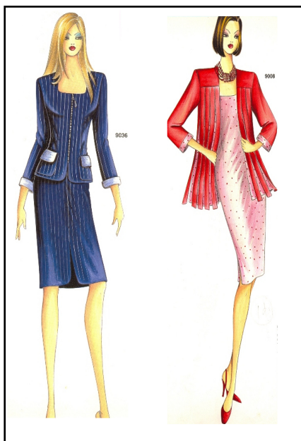
Plate 1: Principle of balance

Balance in a design may be either formal or informal. Formal balance is also known as symmetrical balance or equal balance. In organization, designs which look the same on both sides of a garment, have a formal balance or symmetrical balance. Symmetric balance places style lines and details evenly on the garment (Burke).