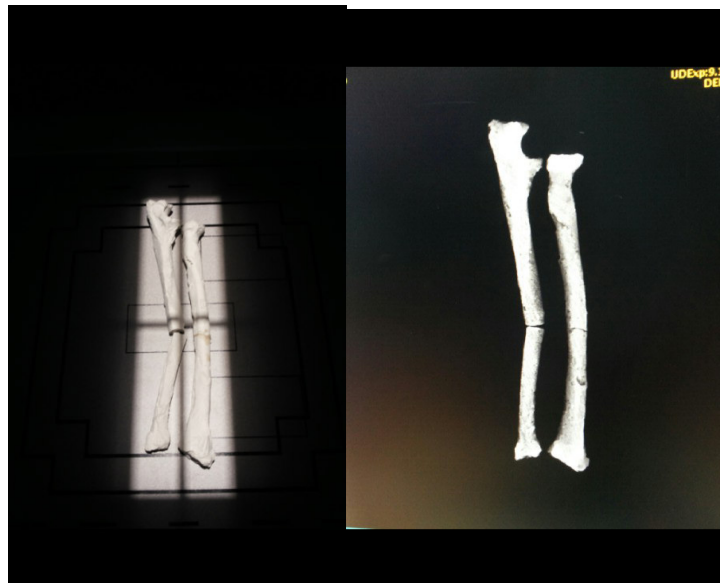
Fig.10: Normal AP position of the artificial bone made from gypsum only (left), and the resultant x-ray image (right).