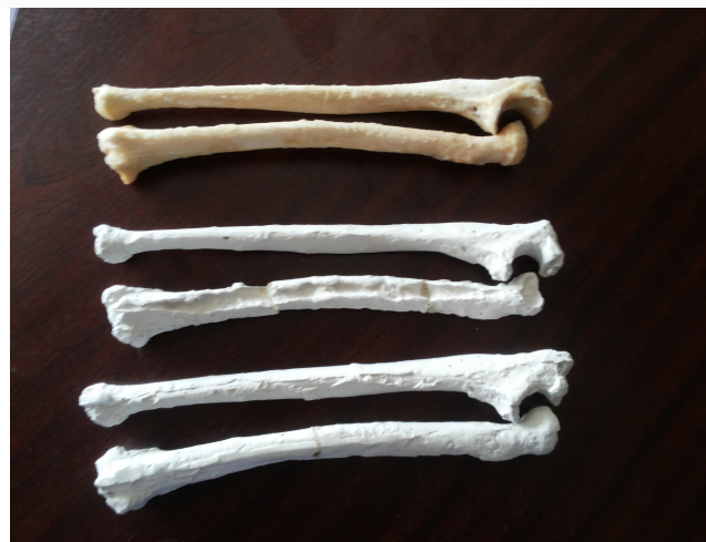
Fig.8: The final model of radius and ulna