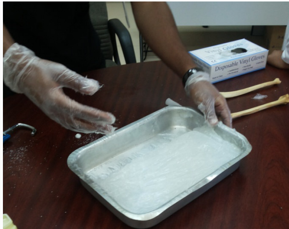
Fig.2 Putting the silicon in the tray