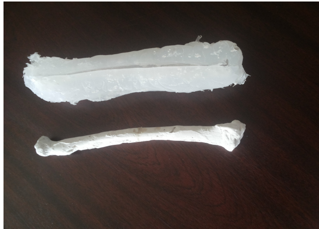
Fig.7: Breaking the phantom that was made it in the both experiments and gluing them.