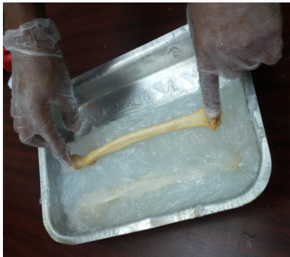
Fig.3: Inserting the original bones inside the silicon to produce a cast used for phantom shape