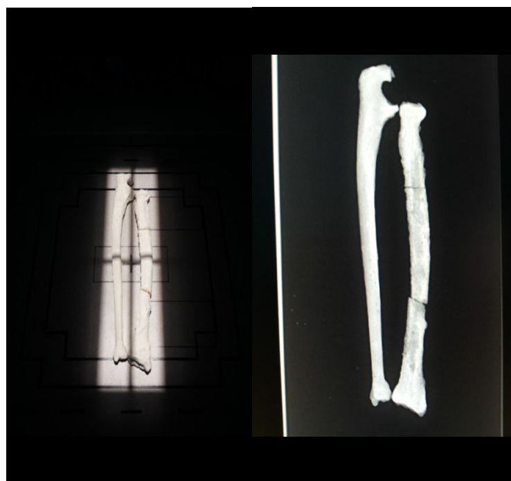
Fig.11: Normal AP position of the other artificial bone i.e. mixture of egg shells and gypsum (left), and the resultant x-ray image (right).