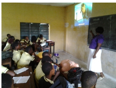
Figure 1: A CPR teaching session before the Hands-on session