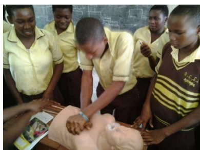
Figure 3: A CPR Hands-on session during the training in another Nigerian secondary school