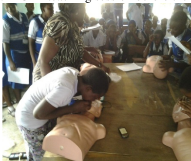
Figure 2: A CPR Hands-on session during the training in a Nigerian secondary school