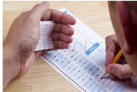
Traditional Exam Cheating