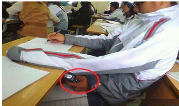
Technology based exam cheating