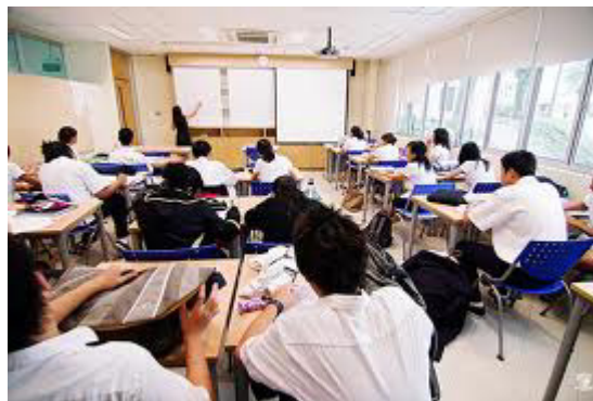
Picture 3 Learning in higher education level in Thailand

From this information, Thailand can gain the potential and credibility in ASEAN Community by setting the policy that supports students in higher education level and those who will graduate to effectively use English in their profession in ASEAN. “That is to prepare for mobility and exchange skilled labors in Thailand to be able to compete with others in ASEAN Community”.