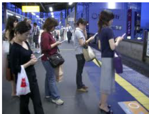
Picture 6: Influence of 3G that connect cosmopolitan civilians through mobile phones

Many people may think that the Sufficiency Economy of King Bhumipol “is the far reaching philosophy and can be adapted in the rural people’s lives”. With in-depth study, this philosophy can effectively support the education. Sufficiency in education means applying the things surrounded us to motivate students to develop their potential. This is pertinent to this article that proposed the use of 3G, advanced technology that has been developed more than 10 years with the budget of 5,300 million Baht. “This budget can construct 100 roads”.