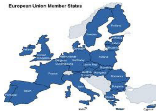
Picture1: European Community map