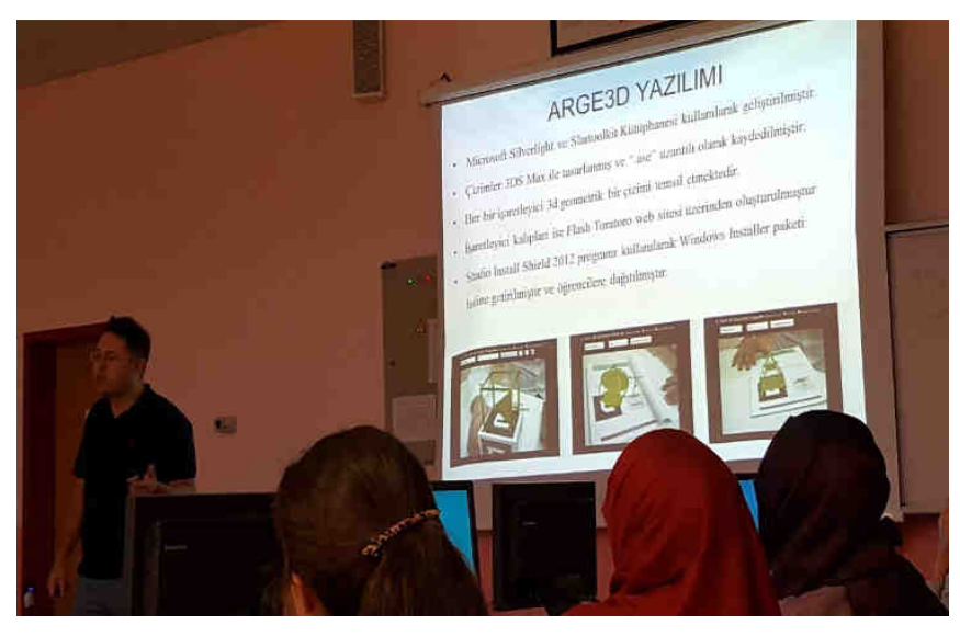
Figure 2. Information about ARGE3D software

The literature surveys done by the participants on teaching geometry via AR technology paved the way for further discussion in the second training seminar. Subsequently, a four-hour (2 hours theoretical and 2 hours application) training seminar on AR technology aided geometry teaching was given by a specialist from the department of Computer and Instructional Technologies Education. (Figure 2).