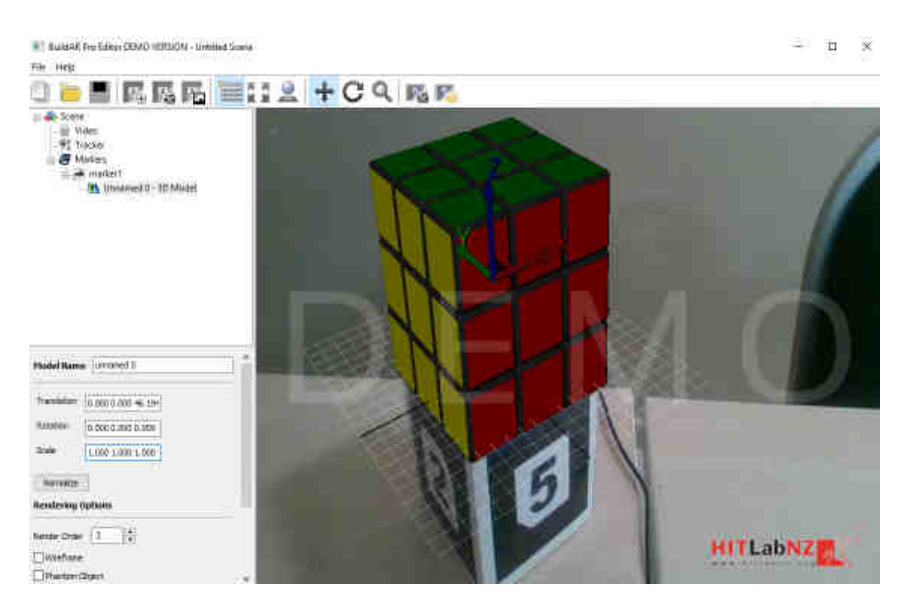
Figure 3. Development of a sample application with BUILDAR PRO 2.0

The teacher candidates reflected the 3D images on the computer screens they used (Figure 3) by using the data matrix data they prepared as described by the instructor.