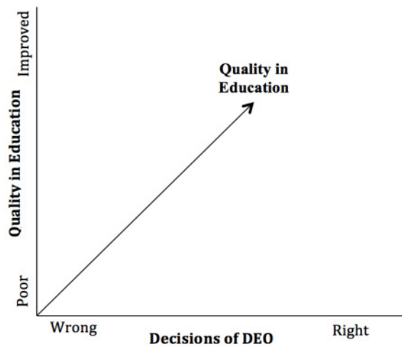
Figure 2: Analytical Framework Graph